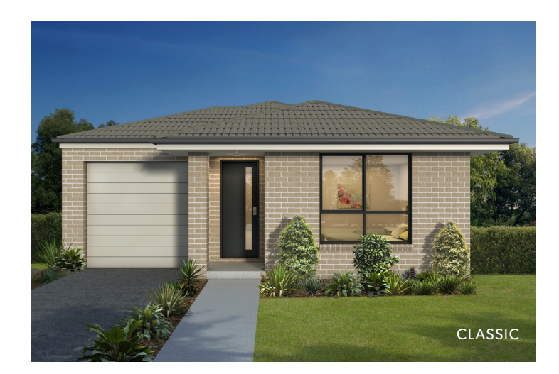
See more facades on our website!

All the New South Homes quality is still there. Four generous bedrooms, two good sized bathrooms and a separate laundry. Not to mention a galley kitchen within an open plan living area. All the key features included at an affordable price.