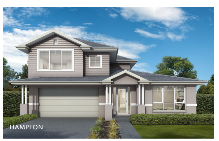
Photographs and artist impressions are indicative only. They may include upgraded features above the standard inclusions such as, but not limited to; feature render, feature tiling, stack stone landscaping floor finishes, window furnishings, furniture, light fittings and decor items. Please refer to the standard inclusions for details or speak with a New South Homes Ptv. Ltd Ruiklers License Number: 319502C